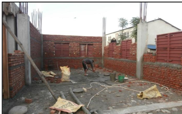
Building work in progress at Narayani Adhabhut School

This school have embarked on a phased project to rebuild some old and some earthquake damaged classrooms. They held a special fund raising 'puja' (ceremony) within their community and sought funds from the local government. We are very grateful to the donations raised in memory of Man Chung Li (1965-2016) which have contributed to this project. At our visit, it was great to see good progress being made with construction of the ground floor classrooms.