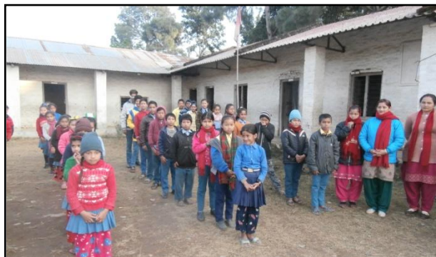
Pupils line up at the welcome ceremony in Dec 2019

This school have embarked on a phased project to rebuild some old and some earthquake damaged classrooms. They held a special fund raising 'puja' (ceremony) within their community and sought funds from the local government. We are very grateful to the donations raised in memory of Man Chung Li (1965-2016) which have contributed to this project. At our visit, it was great to see good progress being made with construction of the ground floor classrooms.